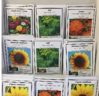
Seed Packets Harvested from last year's yield; packaged for sale at Book Barn