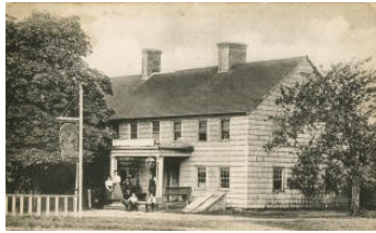
Ketcham Inn established 1710