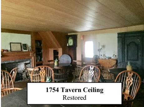
1754 Tavern Ceiling Restored