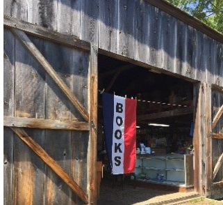
Ketcham Inn Book Barn Open Mon, Thu, Fri 12-5 Sat, Sun 10-5