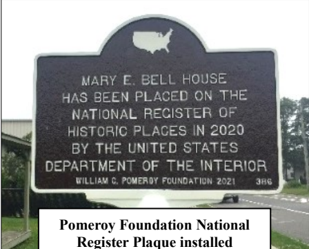
Pomeroy Foundation National Register Plaque installed