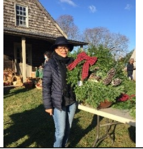
Annual Wreath Project Saturday after Thanksgiving